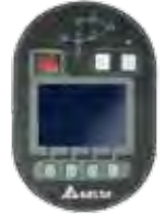
Control and LCD Display Panel

All specifications are subject to change without prior notice.