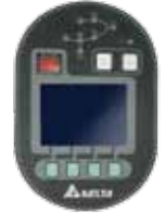
Control and LCD Display Panel

All specifications are subject to change without prior notice.